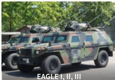
EAGLE I, II, III

OUR 13-SERIES CHASSIS IS APPLIED TO INDIGENOUS VEHICLES AROUND THE WORLD